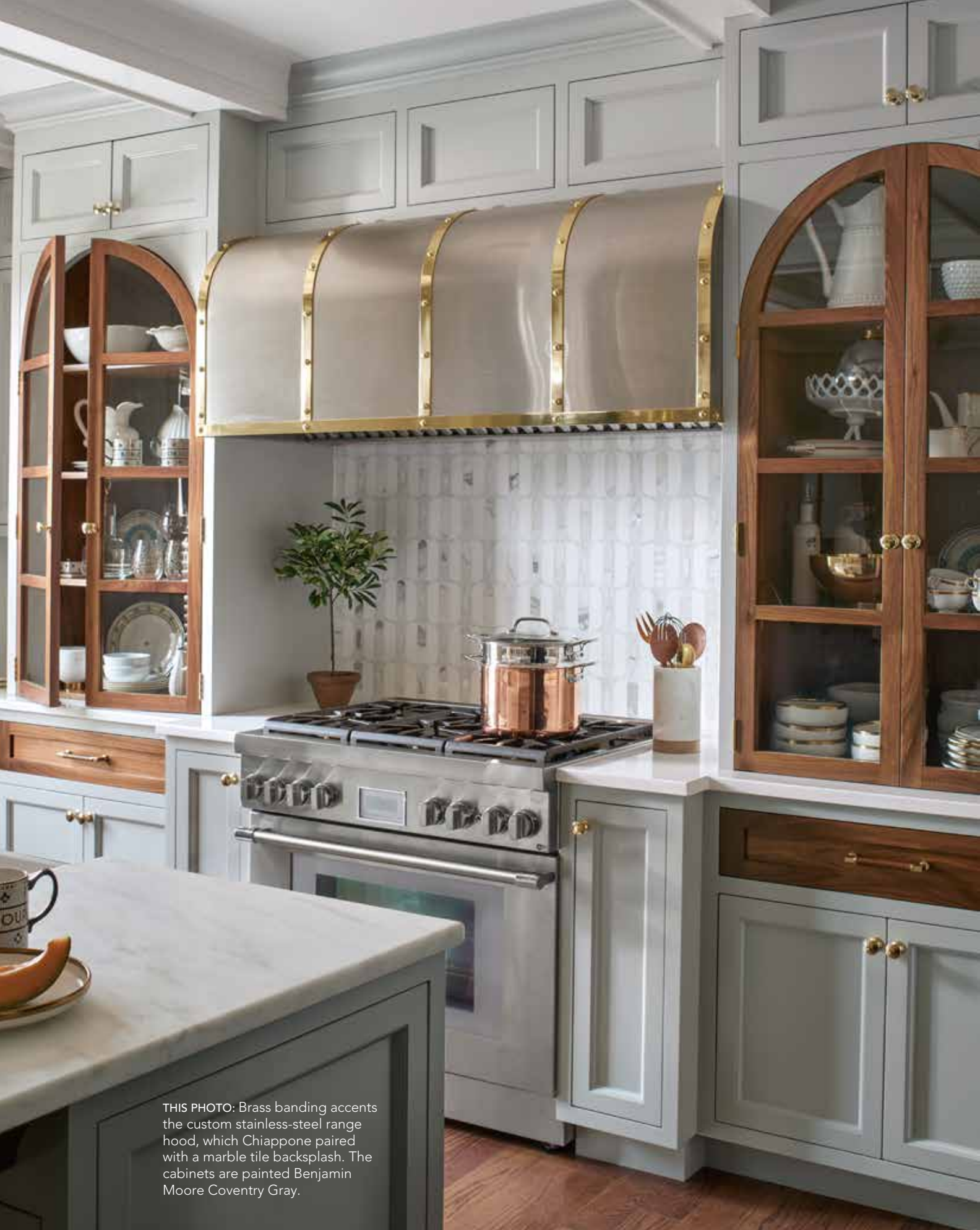
THIS PHOTO: Brass banding accents the custom stainless-steel range hood, which Chiappone paired with a marble tile backsplash. The cabinets are painted Benjamin Moore Coventry Gray.