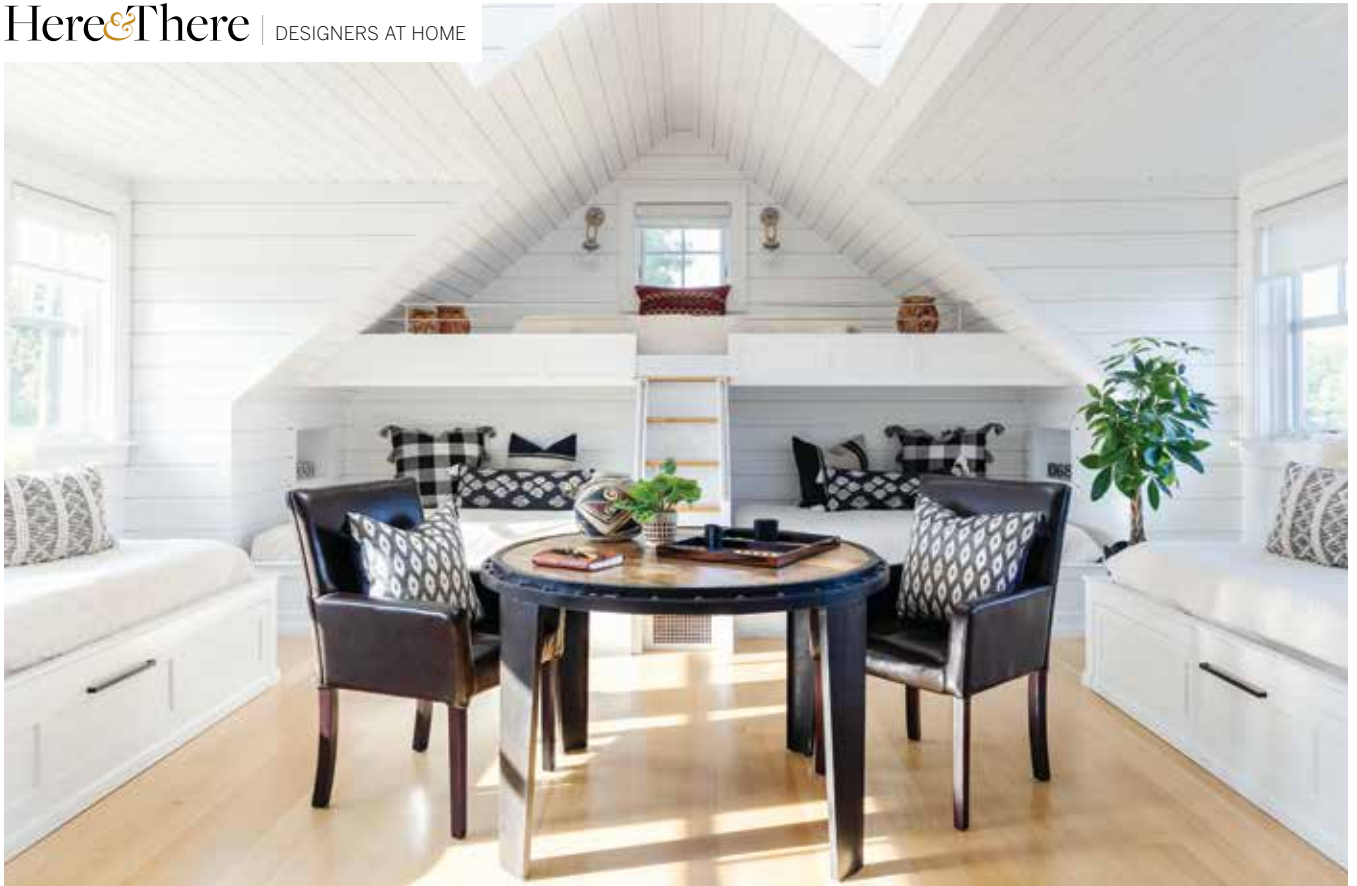
CLOCKWISE FROM ABOVE: In the bunk room, up to nine people can sleep comfortably thanks to the full beds. Byrnes designed the primary bedroom around the reverse-painted-glass bedside tables by John-Richard, which call to mind water and rocks. A deep soaking tub in the primary bath—the Soca freestanding tub by Maax—is a meditative spot for taking in the view; the vintage rug is from Azalea Home & Gift in Niantic.