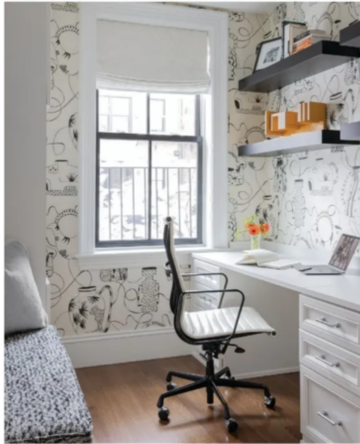
Below: Artful wallpaper brings personality to the study. Right: The lush and elegant primary bedroom.

keepsakes from their travels, Daher designed shelves in the living room that disappear into the plaster with a deep gray backdrop that allows the objects to take center stage. "When I first broached this idea to the client, they were skeptical to go with such a dramatic hue, but once they saw the rendering and were able to visualize the look, they were one hundred percent on board," Daher says. Other special touches were integrated into the design like the fireplace mantel from Chesneys ( chesneys.com ). Coupled with the shelves, it makes the living room warm, inviting, layered and timeless.