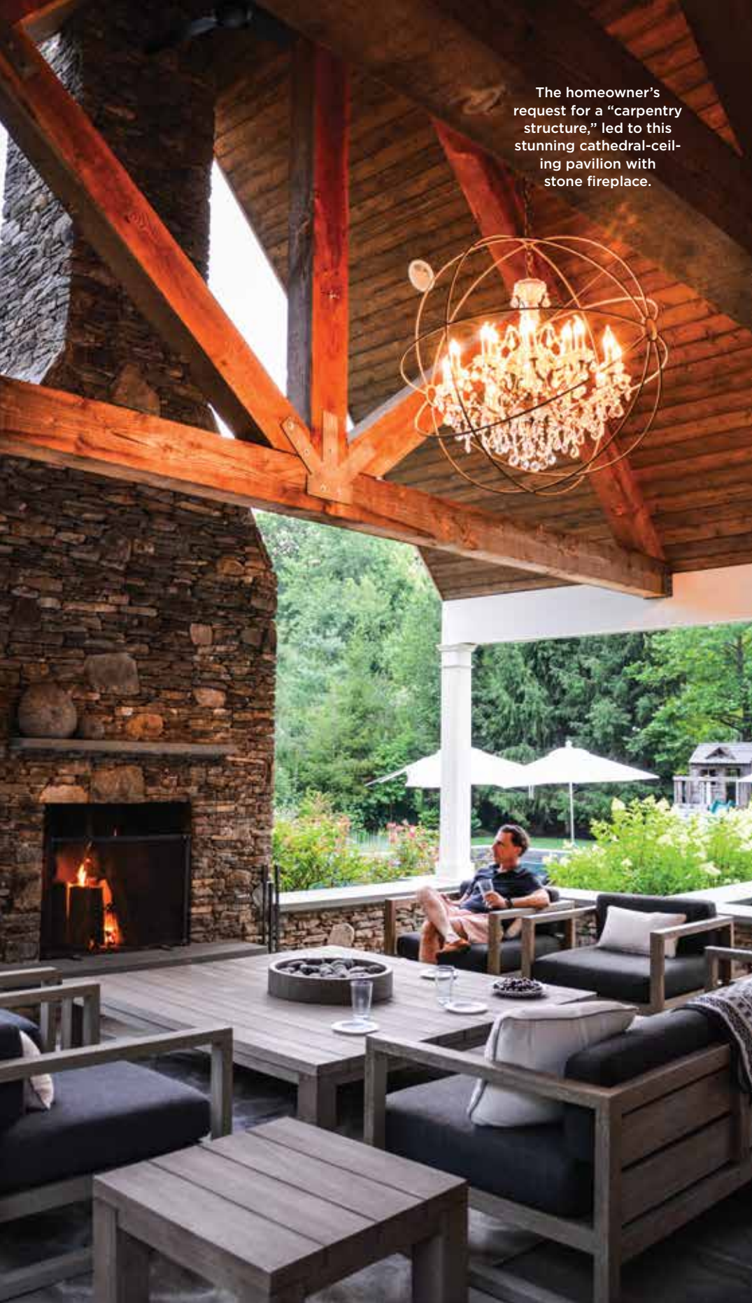
The homeowner's request for a "carpentry structure," led to this stunning cathedral-ceiling pavilion with stone fireplace.