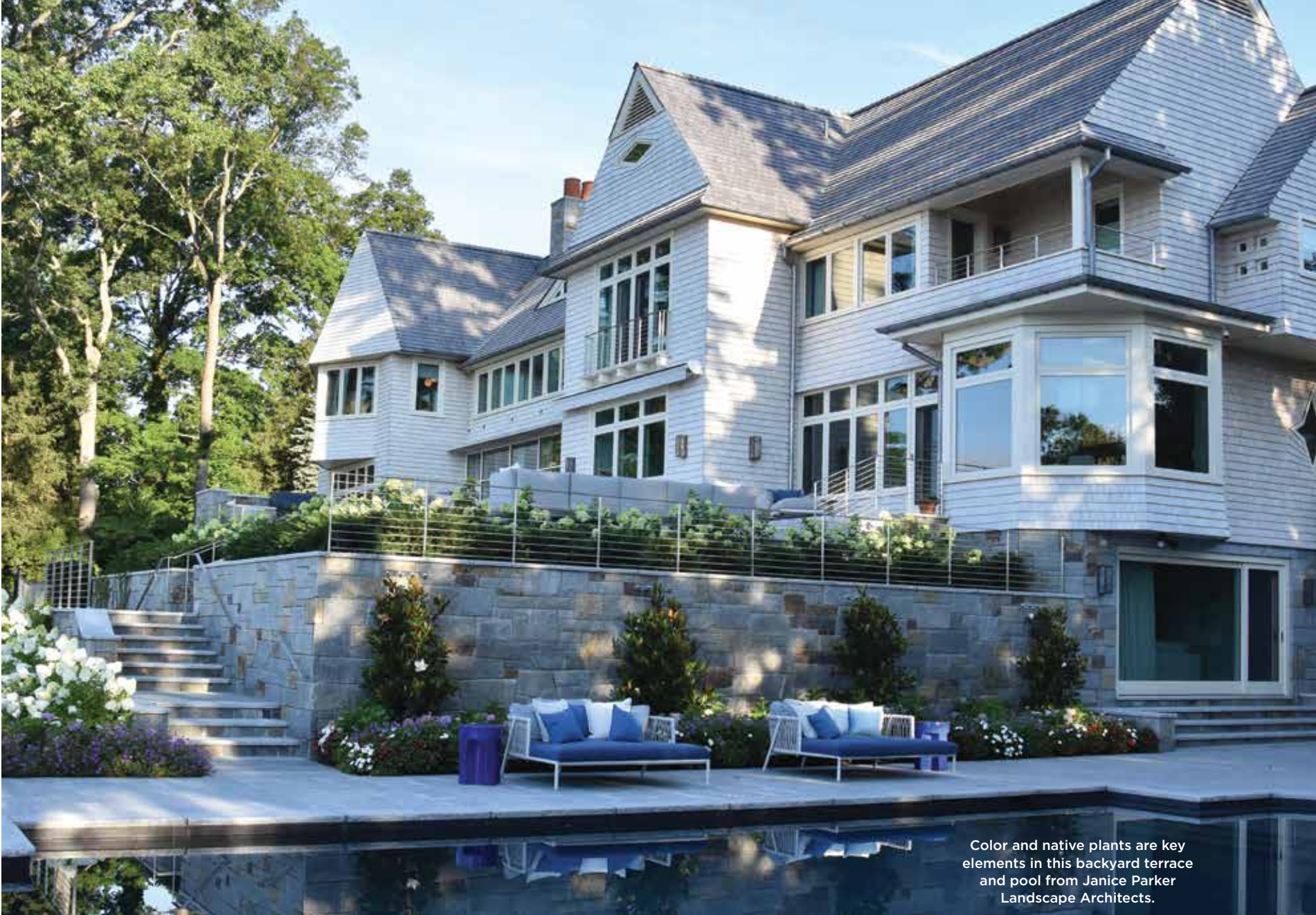
Color and native plants are key elements in this backyard terrace and pool from Janice Parker Landscape Architects.

Two things the homeowners wanted: a carpentry structure and a fire element. The pool and spa were added through the evolution of the design, with the finished space featuring an outdoor kitchen, patio, gas fire pit and ornamental plantings. True Blue bluestone set the tone for the color palette and offered a modern yet natural look to the design, explains Doerflinger. "The color maintains a consistent degree of variability allowing for a clean look without being overly fussy," he says. Rounding out the design are the oversized stairs off the center line of the main egress point to the backyard leading to the spa, which create a strong connection from the house and draw you out to the furthest main feature, adds Doerflinger.